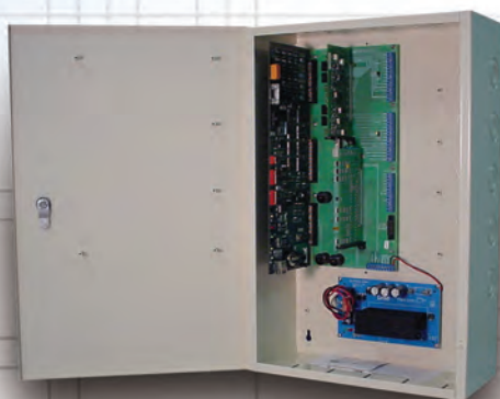
Model 502i - Two Door Version