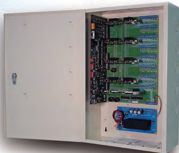
Model 508i - Eight Door Version

Modular design allows for easy expansion. Allowing control of up to eight doors per 508i panel (up to two on the Model 502i), multiple 508i and/or 502i panels can be linked together to create a custom system that is as large (or small) as needed.